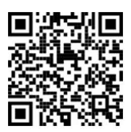
Scan to check out our website!